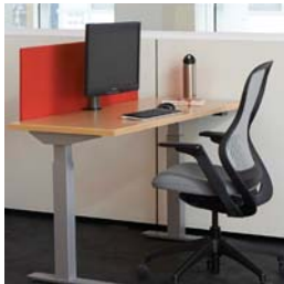
Privacy screens can only be specified with glides

Accepts standard Antenna Workspaces, Morrison Network and Upstart privacy screens, as well as Reff Profiles and AutoStrada partial modesty panels