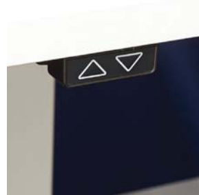
Standard up/down control