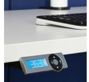
Digital display control with programmable settings