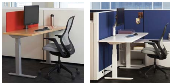
Bases painted in all Silver and all Bright White

Bases available fully painted in all core paint finishes