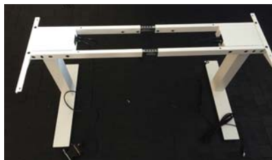
Adjustable Width Crossbar

Adjustable width crossbar expands to fit a range of top sizes