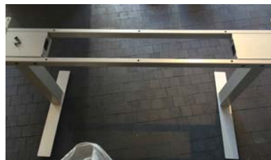
Fixed Width Crossbar